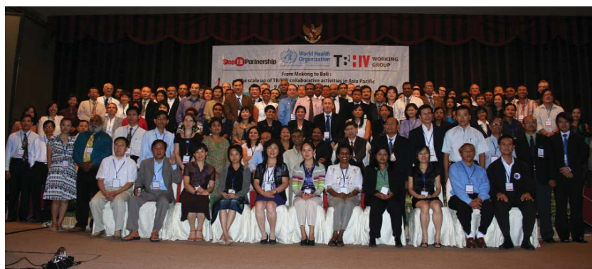
Participants at the "From Mekong to Bali" meeting, 2009