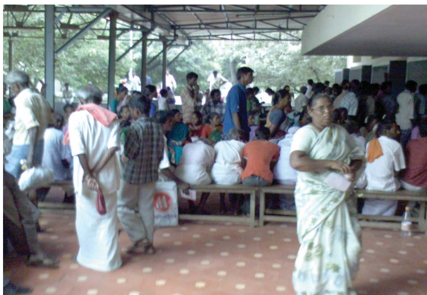
Infection control in India: A waiting area outside an outpatient department

All countries in Asia-Pacific need to develop integrated infection control guidelines at all levels. They also need to carry out much more advocacy for partnership development and to mobilize greater resources.