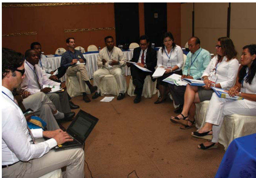
Group at the Bali meeting discussing key issues and mapping out action plans

Although most countries report having infection control policies, none reports on other TB infection control indicators. This needs to be addressed as part of the regional response to infection control.