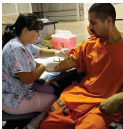
Joint planning for drug users needs coordination

Drug users should be treated like any other person with a medical need and the right to services. In fact, people who use drugs are receiving increasing attention as part of the regional HIV response, but as yet the capacity of drug user networks and services to address TB is limited. Broad dissemination and implementation of the joint WHO/UNODC/UNAIDS guidelines for addressing TB/HIV in injecting drug users is important to fill this gap. Contrary to the belief of many clinicians, drugs users' adherence to TB treatment, IPT and ART is equivalent to that of non-drug users. Perhaps this is because "nobody knows better how to take drugs than a drug user".