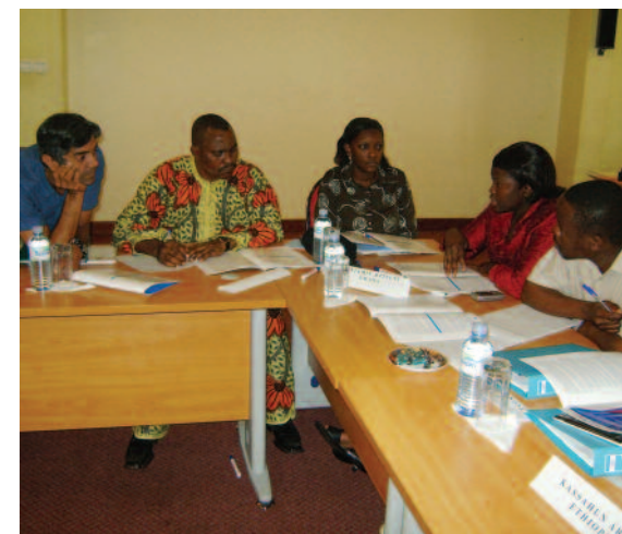
Participants working on advocacy plans for TB/HIV, Entebbe, Uganda, September 2008

Activists who are literate in the scientific as well as the policy and programmatic aspects of TB and