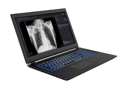
(Laptop to be procured separately)