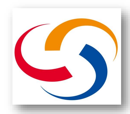
Global Fund Replenishment

Support successful replenishment of Global Fund in 2016