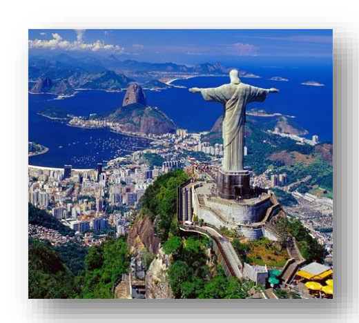
Support BRICS TB Engagement