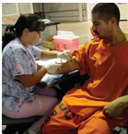
Joint planning for drug users needs coordination

Drug users should be treated like any other person with a medical need and the right to services. In fact, people who use drugs are receiving increasing attention as part of the regional HIV response, but as yet the capacity of drug user networks and services to address TB is limited. Broad dissemination and implementation of the joint WHO/UNODC/UNAIDS guidelines for addressing TB/HIV in injecting drug users is important to fill this gap. Contrary to the belief of many clinicians, drugs users' adherence to TB treatment, IPT and ART is equivalent to that of non-drug users. Perhaps this is because "nobody knows better how to take drugs than a drug user".