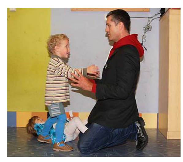
Rupert Everett, Special Representative of UNAIDS, visiting The Russian Federation

UNAIDS:<www.unaids.org/en/MediaCentre/ PressMaterials/FeatureStory/20071009 Overwhelming and Inspiring".asp>